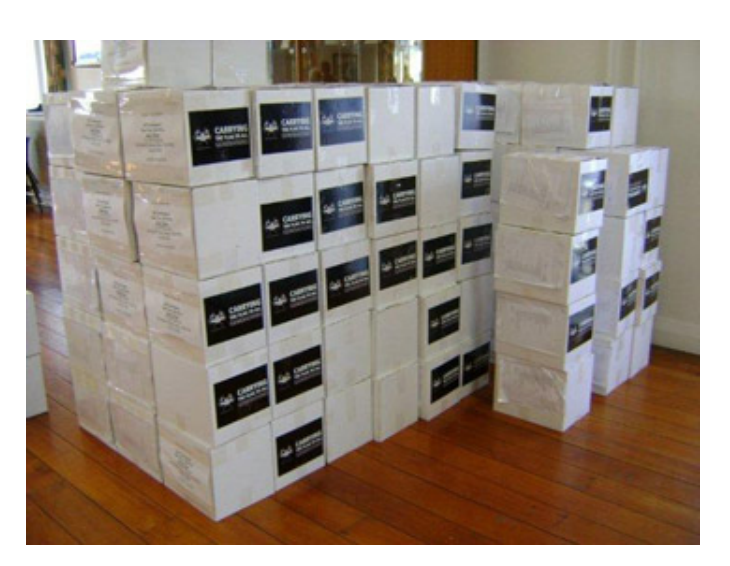
The Christmas parcels ready for deployment to 11 countries across the globe.

Our warmest wishes and Christmas greetings Kia Ora! Meri Kirimete! Kia Kaha!"