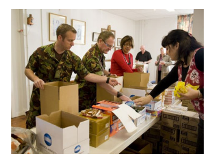
Defence Force personnel and RSA staff and volunteers package the parcels at HMS Olphert in Mt Cook, Wellington.

This year, back in September, almost 450 parcels were packed by personnel from the Defence Force, Police, RSA volunteers as well as students from Mt Cook School which is across the road from the National War Memorial and HMS Olphert where the parcels were packed. They included such Kiwi classics as Whittakers peanut slabs, Watties tomato sauce, Anzac biscuits, Christmas mince pies, marmite, chippies and onion dip ingredients, Jaffas and chewing gum, as well as handmade Christmas cards from school children from Papakura, Waiouru, Burnham schools and Wellington's Mt Cook school.