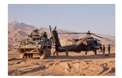
Photo captions: 001 - A NZLAV is used to tow a disabled US Army Apache helicopter inside the wire of Kiwi Base.