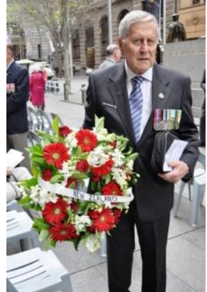
officials stood proudly with the other dignitaries in remembrance or our fallen.